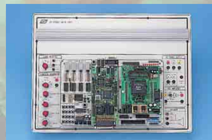
CIC-500 DSP Standard Version